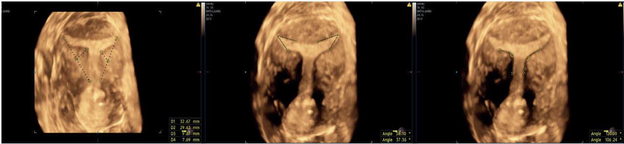
Figure 1: 3D-US diagnosis of T-shaped uterus, according to CUME consensus (Ludwin et al., 2019): the uterus showed: both lateral indentation depth \geq 7 mm in size, bilateral T-angle \leq 40^\circ and both lateral indentation angle \leq 130^\circ . No indentation was detected at fundus level.

(Di Spiezio Sardo et al., 2020). In 1992, Golan et al demonstrated an association between T-shaped uterus and a high rate of first-trimester miscarriage (47%) and a low rate of full-term delivery (21%) (Golan et al., 1992).